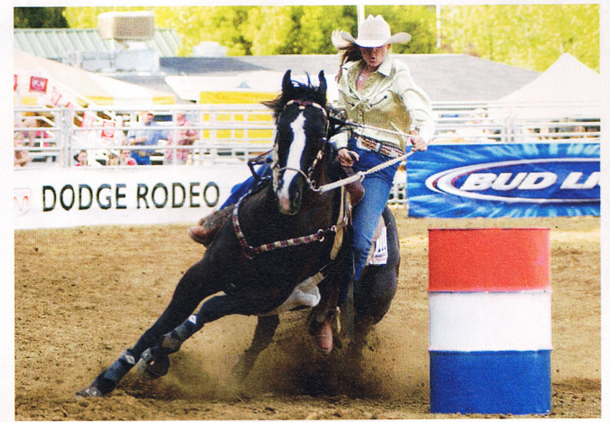
This cowgirl is at a rodeo. She can ride a horse.